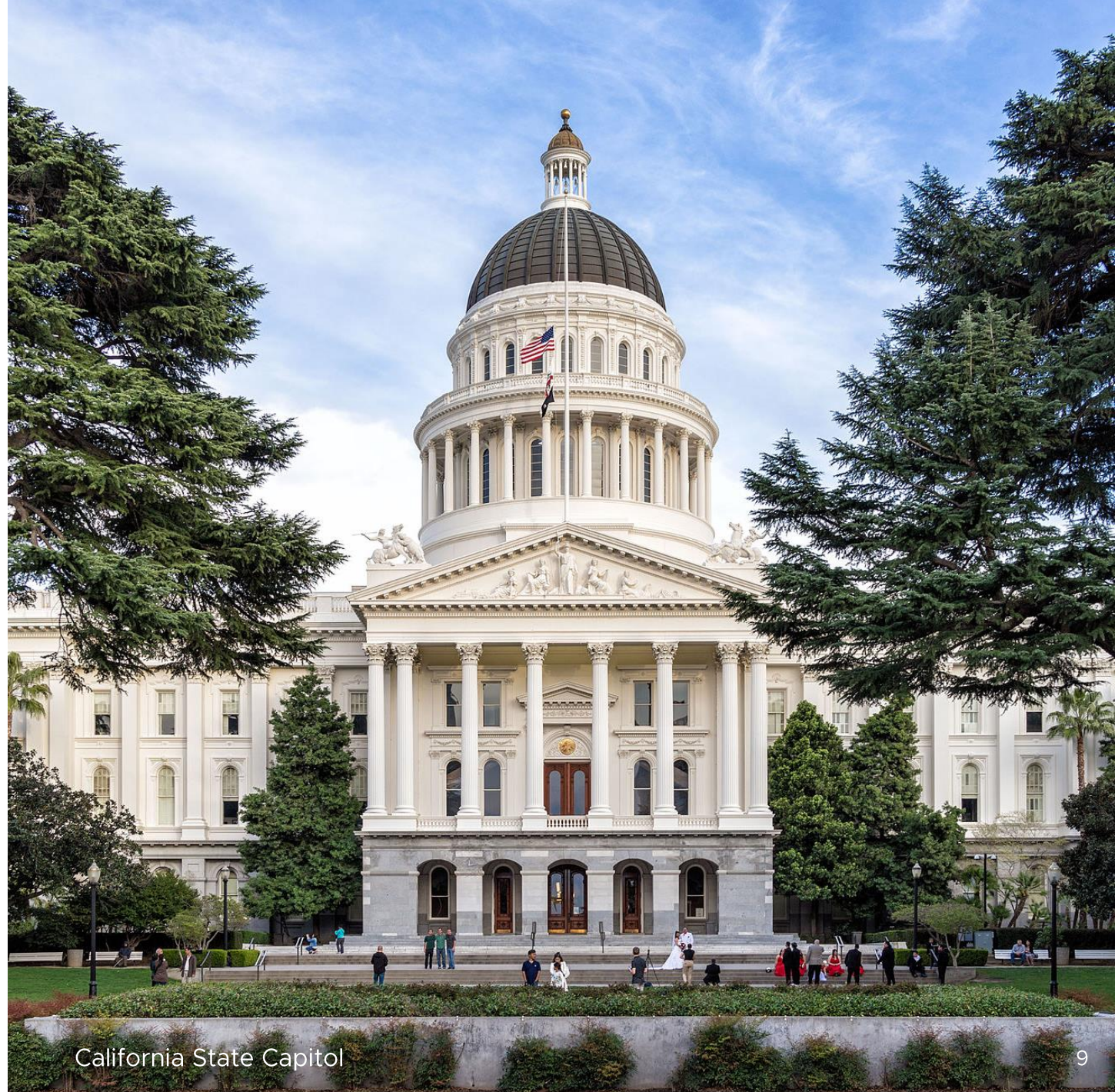
California State Capitol